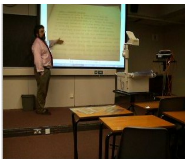
Illustration 3: Part of the Unit History of 42nd Infantry Bn, UNIFCYP, in a lecture on Peacekeeping in my 'War, State & Society' course

There are a variety of reasons for doing this. People do not usually fly off and act a radical tangents. People work by rationalising the actions within a narrative sequence of events, events driven on by choices made on the basis of decisions which were rational within their context, and intentional, not accidental. Historians work by discovering and making clear these patterns of human actions, and presenting them in turn as coherent narrative accounts. 'Soundbiting' quotes into lectures does not do justice to understanding the worldview of the original primary actor, the empathic recreation of the historian and does not show students how to engage with the texts to discover the flow and the highlights of the story for themselves. No course allows page by page reading of all the sources for a particular topic, but it seems to me that if we are going the students to read history, we need to take the time to show them examples of how it is written both by participants and professionals.