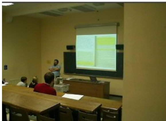
Illustration 2: Part of Ted Heath's memoirs, with highlighting. There is a text block of notes in the upper left corner of the slide

In my teaching I seek to bridge the gap between lecture and reading, to show more clearly how the two link but bringing more of the reading into the lecture. Thus for example in post-war British political history (Hi3003) I make use of selections from both the memoirs of the participants themselves and from critical biographies as well as the growing range of secondary texts on the period. It can be argued that one can serve